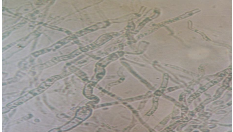
Fig. 2. Morphological changes of F.oxysporum f. sp. sesami mycelia by B. megatherium stress